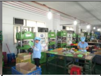
Two compression molding workers worked without earplugs.