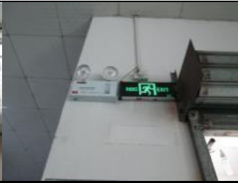
Emergency light and exit sign