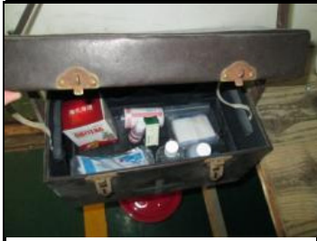
First aid kit